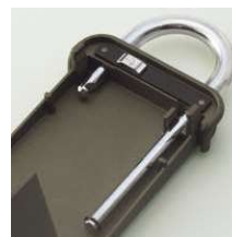
Shackle can be adjusted in 2 stages.

※ Sometimes Key storable qty changes depends on the key size.