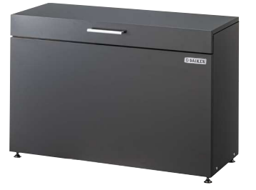
Effective internal dimensions(mm) Frontage 900 × Depth 350 × Height 570